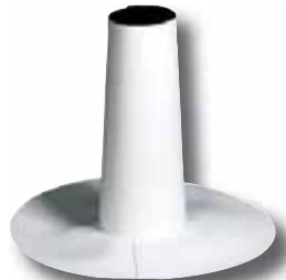
TPO Split Pipe Seals

* Please see VersiWeld accessories literature for a more complete listing of accessories.