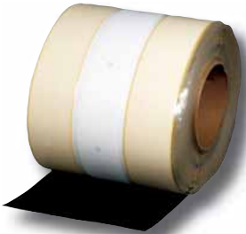
TPO PS RUSS

All VersiWeld TPO accessories carry the Certified Fabricated Accessory (CFA) seal of approval meaning they adhere to the most stringent quality tolerances required to be included in a Versico warranted roof system.