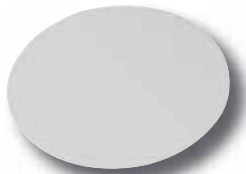
TPO T-Joint Covers