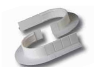
TPO Molded Sealant Pockets