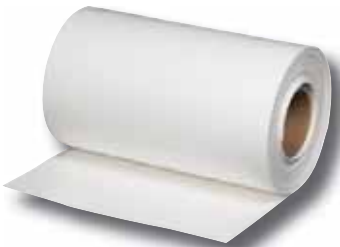
TPO Non-Reinforced Flashing