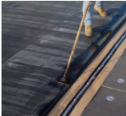
Apply QuickPrime™ primer to membrane.