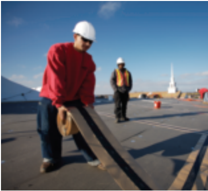
Install QuickSeam R.M.A. Strips.

The Firestone name is synonymous with quality, innovation and leadership. Through annual investments in research and development, we remain at the forefront of advances in roofing technology.