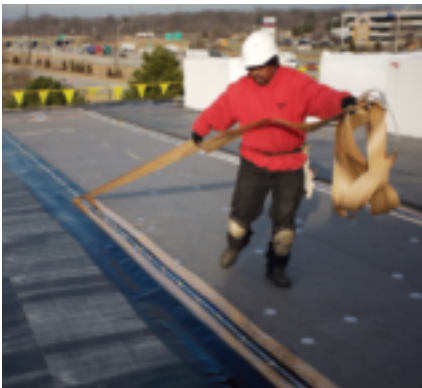
Remove release liner from R.M.A. Strip.